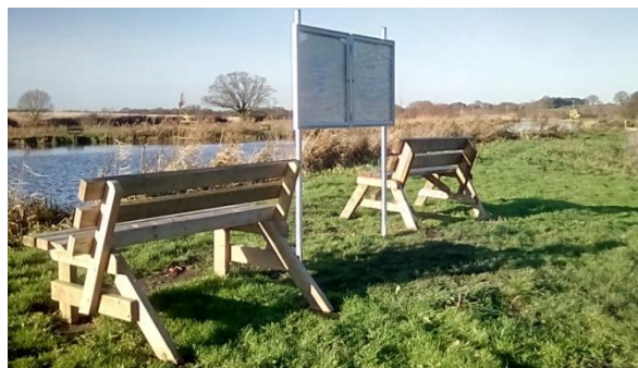
The noticeboard at Ebridge Lock