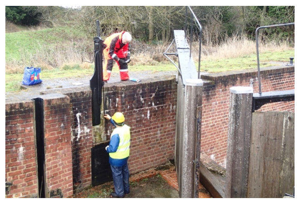
Replacement lock paddle rod being installed (two pictures)

Another group cleared all over hanging brambles, buddleias, and alder trees from Spa Common bridge upwards.